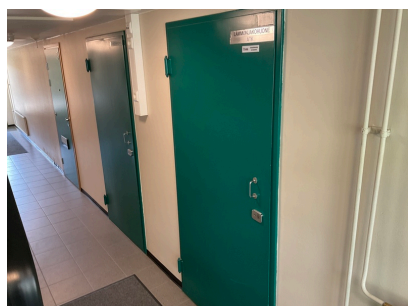
Lämmönjakohuoneen sisäänkäynti kadun puoleiselta sisäänkäynniltä