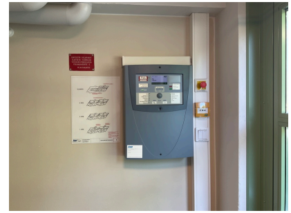
Paloilmoitinkeskus, ilmanvaihdon hätäseispainike, savunpoiston etälaukaisu ja savunpoistokaavio