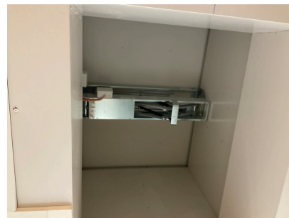
Savunpoistoluukut C-talon B- rapussa, D-talon A- rapussa ja E-talon B- rapussa