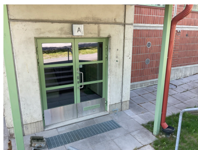
Putkilukot C-talon A-rapun ovella kadun puolella