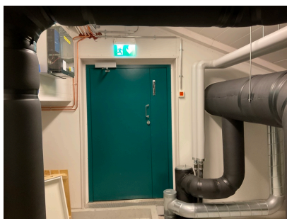
Poistumisopasteet rappukäytävään kohti

Poistumisopasteet ullakolta rappukäytävään