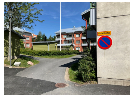
Pelastustien sisäänajo Pellon- reunasta