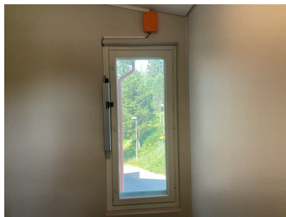
Savunpoistoikkunat C-talon A-rappu ja E-talon A-rappu