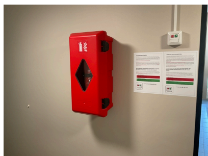
Käsisammutin 6kg ABC-jauhe