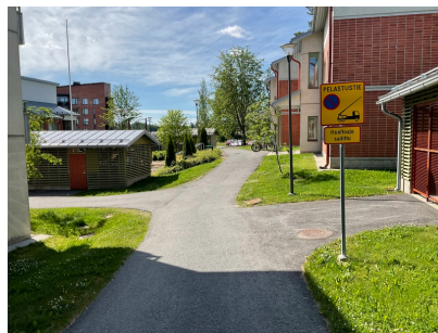
Pelastustien sisäänajo Kekko- lantieltä kevyenliikenteenvä- län yli