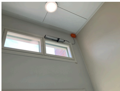
D-talon B-rapun savunpoistoikkuna