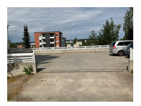
B,- C- ja D-talon kokoontumispaikka pysäköintilaitos 2.

When people have left the building and proceeded to the gathering area, one person must be appointed to take responsibility for the activities at the gathering area. Based on the situation at hand, it is necessary to consider whether it is safe to remain in the designated gathering area or if people should be directed elsewhere, for example into a pre-arranged interior area or to a property in the vicinity (the back-up gathering area).