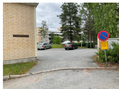
Pelastustien ajo Ykköspesänkadulta