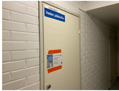
Käynti kuntosaliin A4 oven vierestä