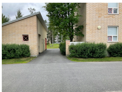
Pelastustien ajo Polttolinjalta