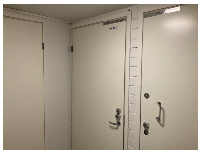
Lämmönjakohuoneen ovi B29 asunnon jälkeisen oven aulati- lassa