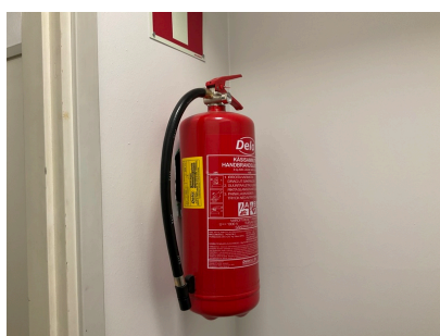
Käsisammutin 6kg ABC-jauhe