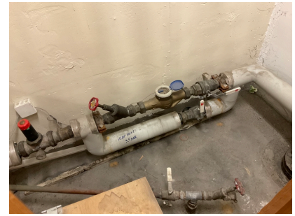
Veden pääsulku kuntosalissa A4 oven vieressä