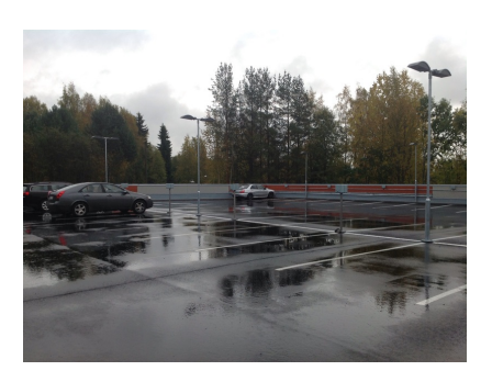
Assembly point in the car park

When people have left the building and proceeded to the gathering area, one person must be appointed to take responsibility for the activities at the gathering area. Based on the situation at hand, it is necessary to consider whether it is safe to remain in the designated gathering area or if people should be directed elsewhere, for example into a pre-arranged interior area or to a property in the vicinity (the back-up gathering area).