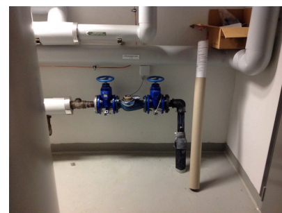
The main water cut-off valve in the heat distribution room