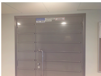
Access into the heat distribution room