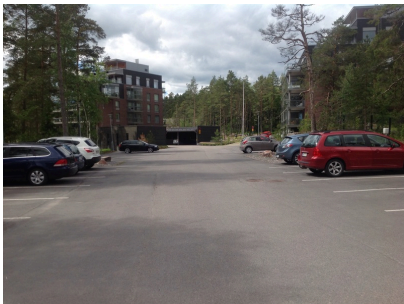
Assembly point on the side of the car park

When people have left the building and proceeded to the gathering area, one person must be appointed to take responsibility for the activities at the gathering area. Based on the situation at hand, it is necessary to consider whether it is safe to remain in the designated gathering area or if people should be directed elsewhere, for example into a pre-arranged interior area or to a property in the vicinity (the back-up gathering area).