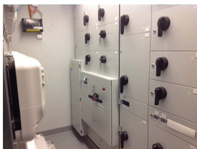
Main electrical switchboard in building A