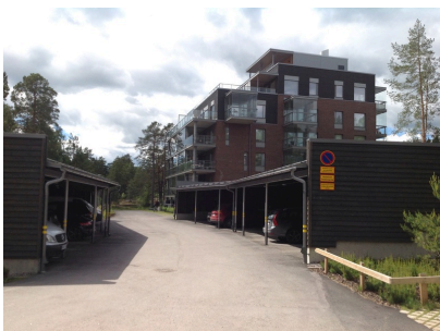
The rescue road to the ent-