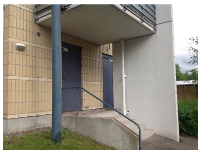
The access into the technical areas is signposted