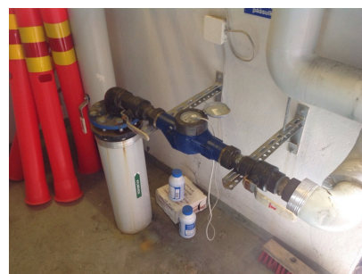
The main water cut-off valve in the heat distribution room