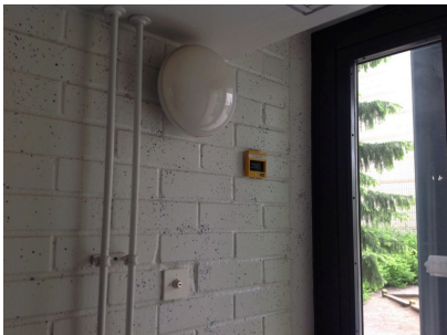
Air-conditioning emergency stop at the entrances on the side of the inner courtyard