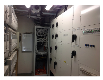
Main electrical switchboard in building B