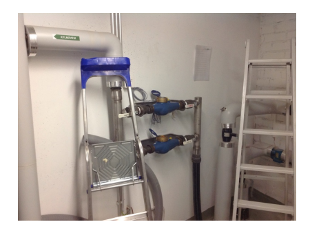
The main water cut-off valve in the heat distribution room