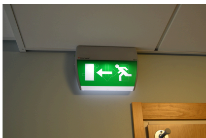
Exit route sign