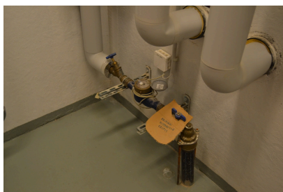
Main water cut-off valve