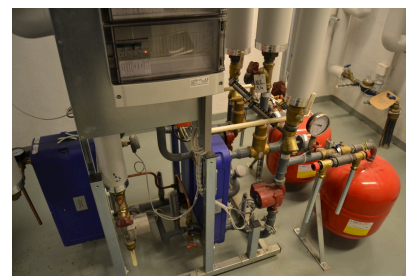
The appliances of the heat di-