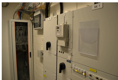
The apparatus of the main