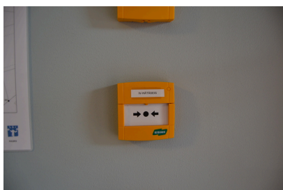
Air-conditioning emergency stop button