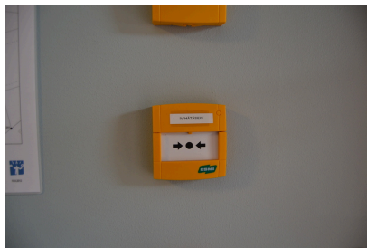
Air-conditioning emergency stop button