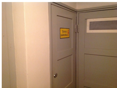
The main electrical switchboard in the basement