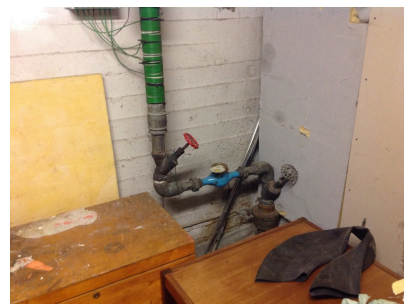
The main water cut-off valve in the heat distribution room