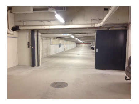
Automatic fire door in the parking garage

In the parking garage on the edge of the properties