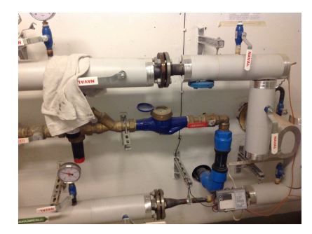
The main water cut-off valve in the heat distribution room