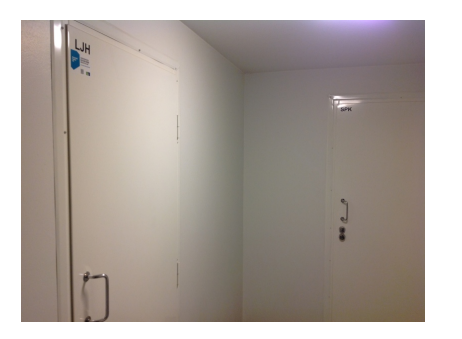
Access into the technical areas