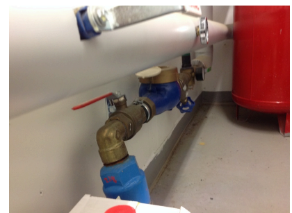
The main water cut-off valve in the heat distribution room