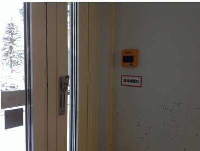
Smoke extraction activation at the entrance