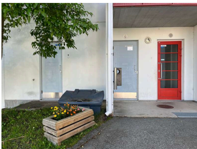
Käynti teknisiin tiloihin