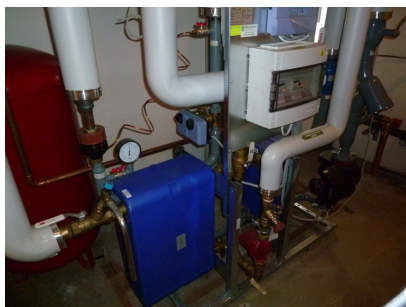
Heat distribution room.