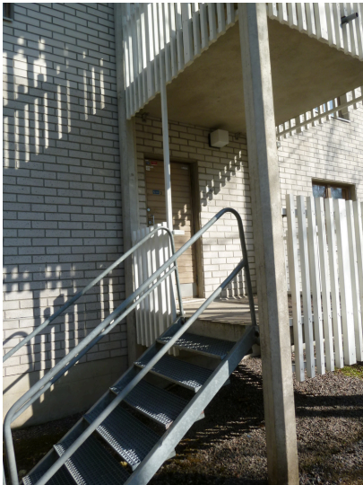
The exterior door of the technical areas