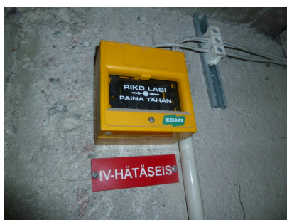
Air-conditioning emergency stop, parking garage