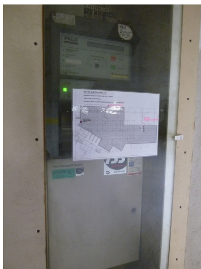
Fire alarm centre