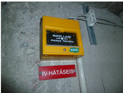
Air-conditioning emergency stop, parking garage