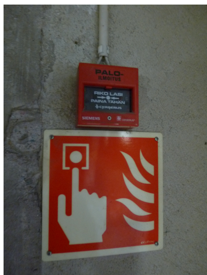
Fire alarm button