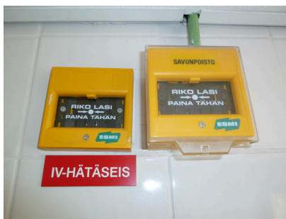
Air-conditioning emergency stop, in conjunction with the entrance

Ventilation emergency stop: In connection with the entrance, Garagehallen, bredvid takskjutporten