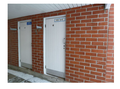
Heat distribution room 1, door