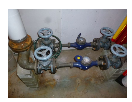
Main water stopcock 3