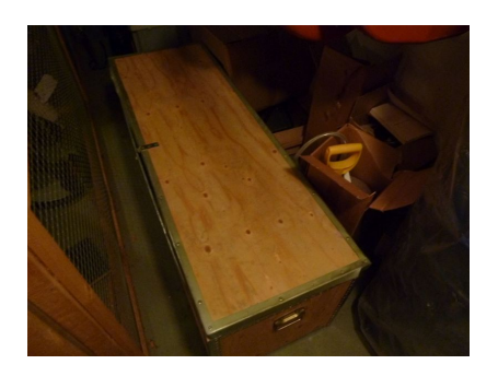
The equipment of civil defence shelter 3