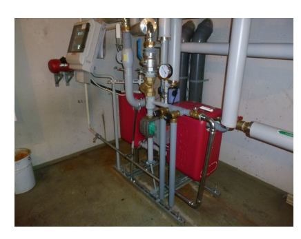
Heat distribution room 2