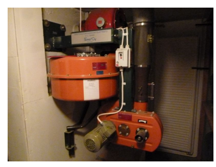
The air-conditioning apparatus of civil defence shelter 2