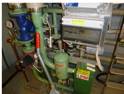
Heat distribution room.