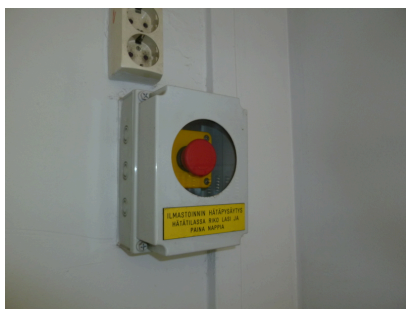
Air-conditioning emergency stop

Ventilation emergency stop: In connection with the entrance