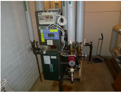
Heat distribution room.