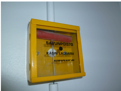
Manual smoke extraction activation