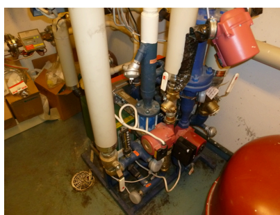
Heat distribution room.