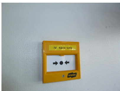
Air-conditioning emergency stop