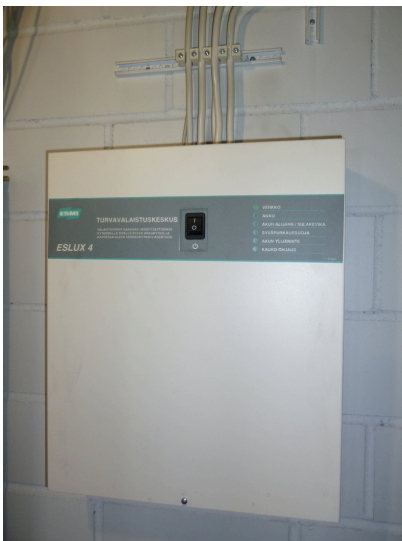
Safety light panel