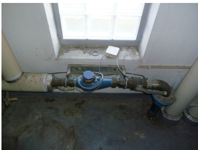
The main water stopcock