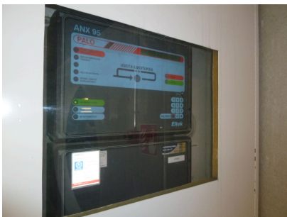
Fire alarm centre