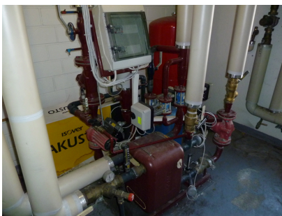
Heat distribution room.