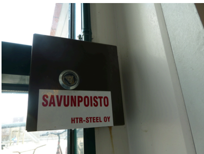
Manual smoke extraction activation