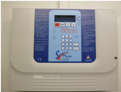
Fire alarm switchboard