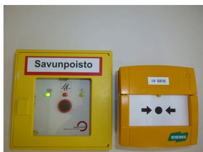
Air-conditioning emergency stop

Ventilation emergency stop: In conjunction with the entrance of staircase A. In conjunction with the entrance of staircase D.