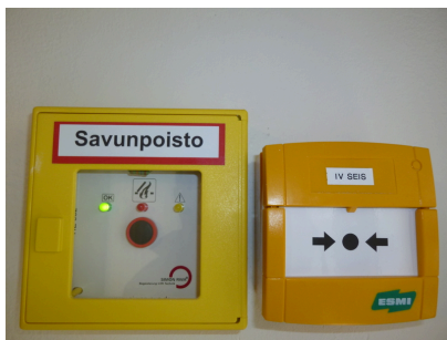
Air-conditioning emergency stop