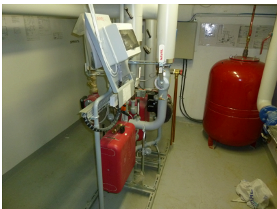
Heat distribution room.