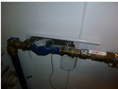
The main water stopcock