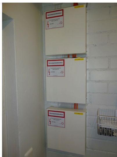
Smoke extraction panel