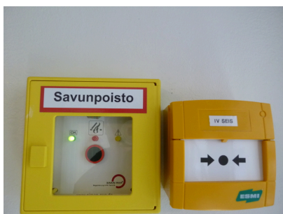
Manual smoke extraction activation