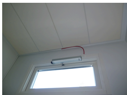
Smoke extraction hatch