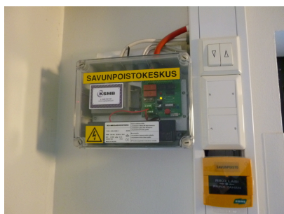
Smoke extraction panel