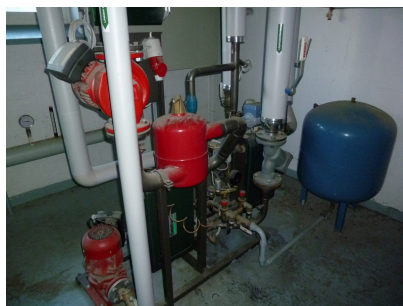
Heat distribution room (building H-L)