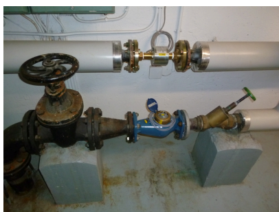
Main water stopcock (building A-G)