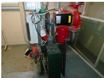
Heat distribution room (building A-G)