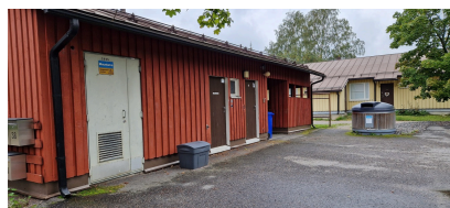
Muuntamo piharakennuksen yhteydessä