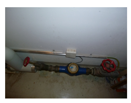
The main water stopcock