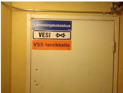
Heat distribution room and water stopcock