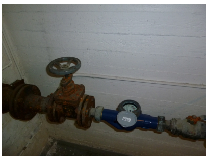
The main water stopcock