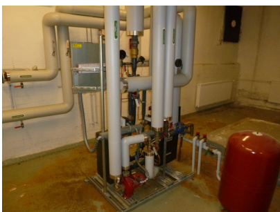
Heat distribution room.