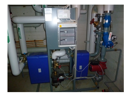
Heat distribution room.