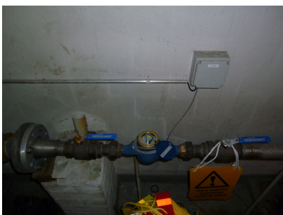
The main water stopcock