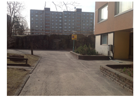
Rescue route, building ABC

The driveways at the front of the buildings