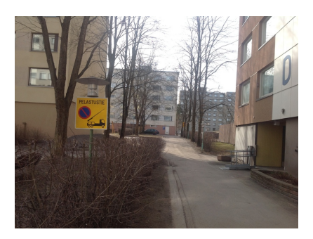
Rescue route, building DE