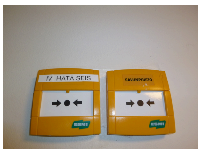
Manual smoke extraction activation