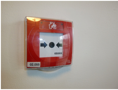
Fire alarm button