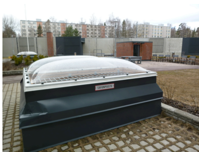
Smoke extraction hatch 1 (parking garage)