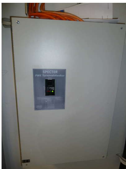
Safety light panel