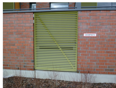
Smoke extraction hatch 3 (parking garage)