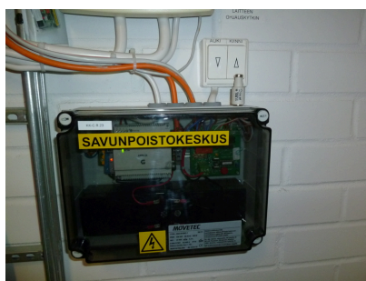
Smoke extraction panel