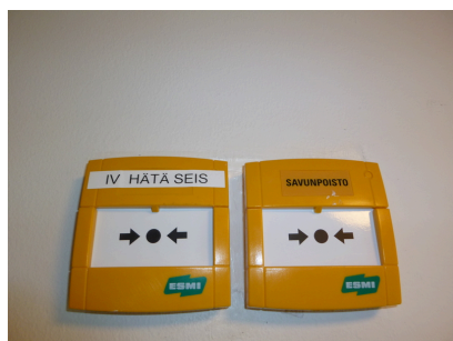
Air-conditioning emergency stop