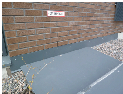
Smoke extraction hatch 2 (parking garage)