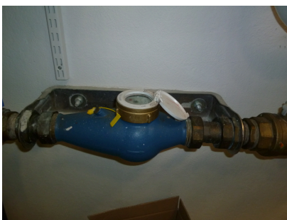
The main water stopcock