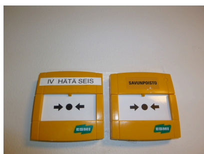
Air-conditioning emergency stop

Ventilation emergency stop: In conjunction with the entrance on the side of the inner courtyard