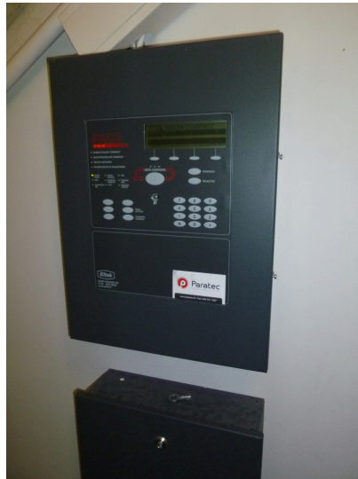
Fire alarm centre