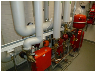
Heat distribution room.