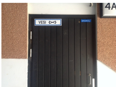
The route to the water stopcock and main electrical switchboard