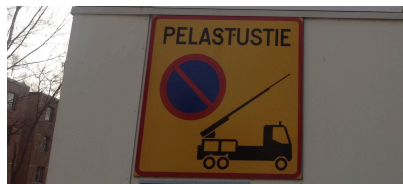
Rescue route sign