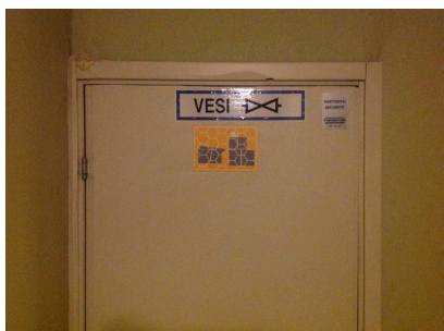
The water stopcock area