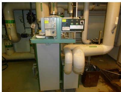
Heat distribution room.