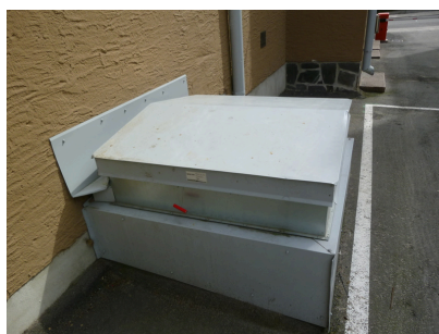
Smoke extraction hatch