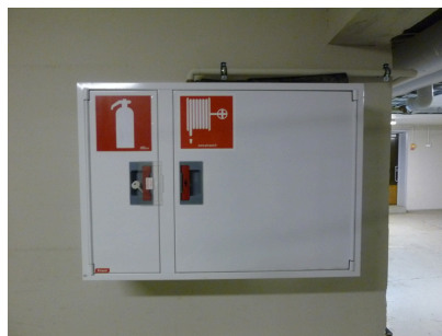
Initial extinguisher and fire hydrant