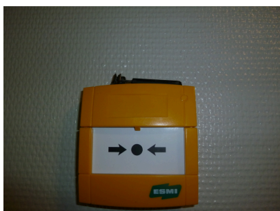
Air-conditioning emergency stop