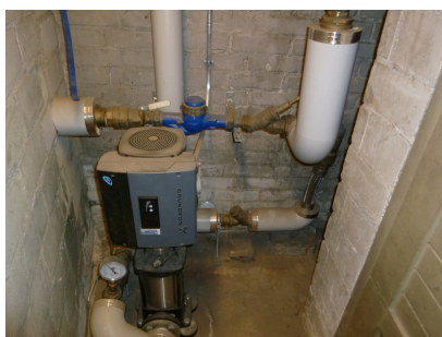
The main water stopcock