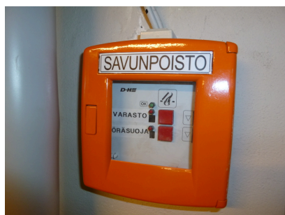
Manual smoke extraction activation