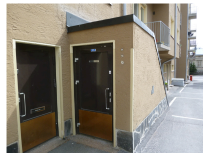
The exterior door of the technical areas