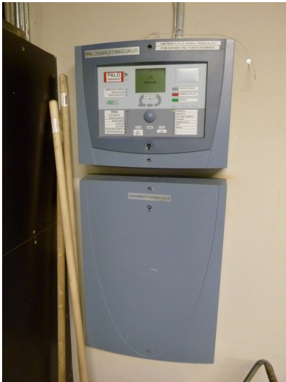
Fire alarm centre