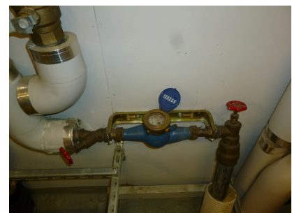
The main water stopcock