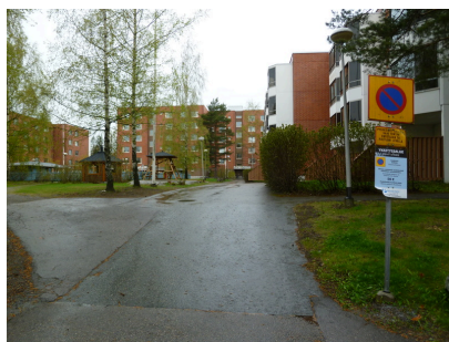
Rescue road via Rotkonraitti