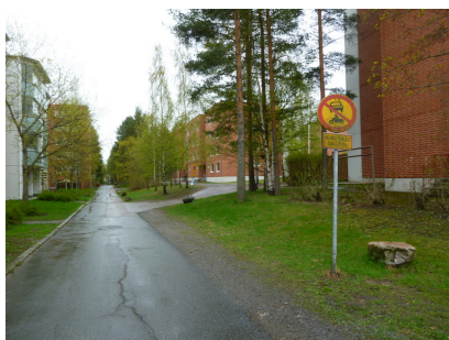
Rescue road from Kanjoninkatu