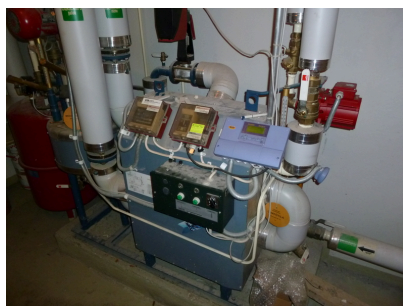
Heat distribution room.