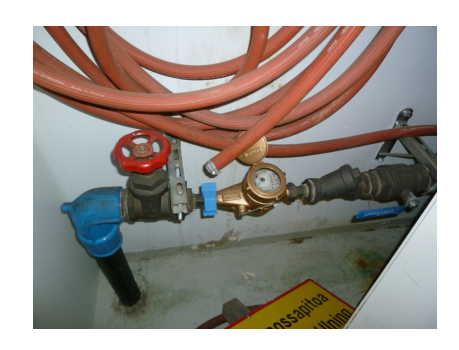
The main water stopcock