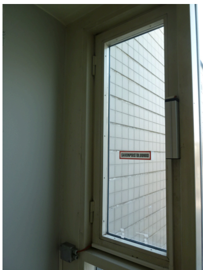
Smoke extraction hatch