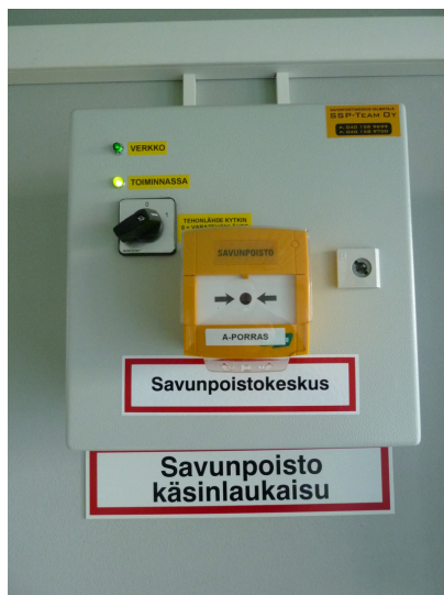
Smoke extraction panel