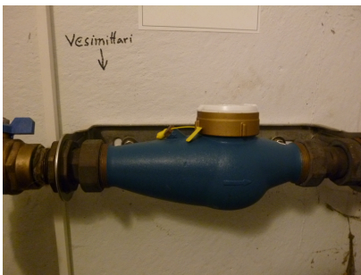
The main water stopcock