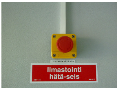
Air-conditioning emergency stop

Ventilation emergency stop: In connection with the entrance