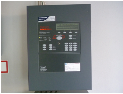
Fire alarm centre