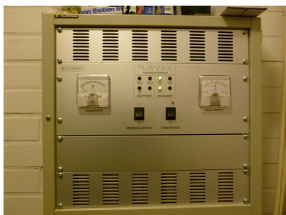
Safety light panel