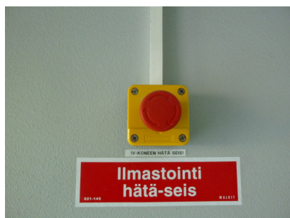
Air-conditioning emergency stop