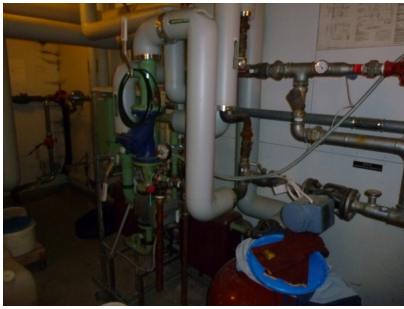
Heat distribution room.