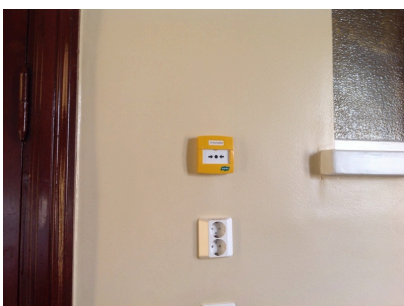
The emergency stop button of the air-conditioning