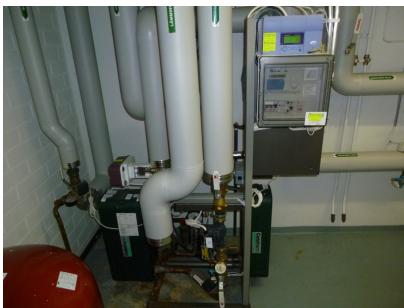
Heat distribution room.