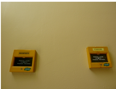
Air-conditioning emergency stop