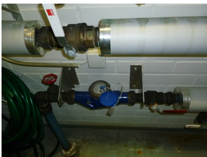
The main water stopcock