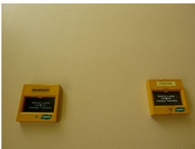
Air-conditioning emergency stop