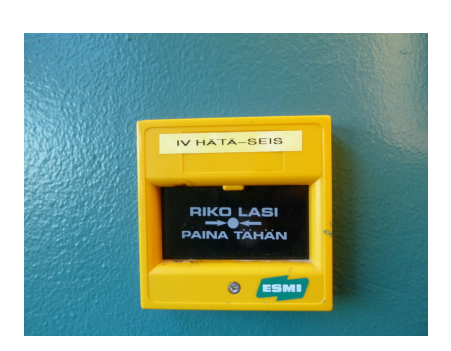
Air-conditioning emergency stop