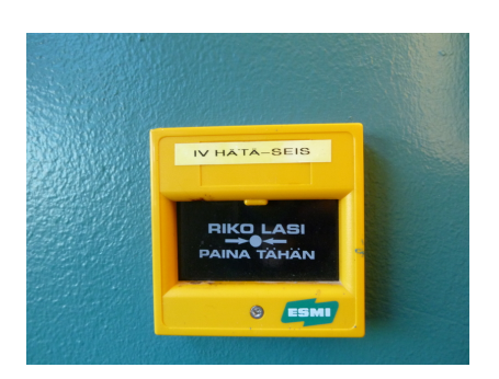
Air-conditioning emergency stop