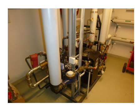
Heat distribution room.