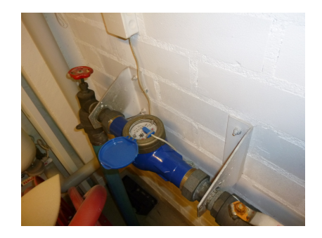
The main water stopcock