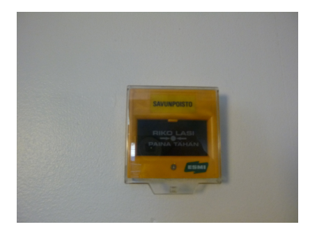
Manual smoke extraction activation