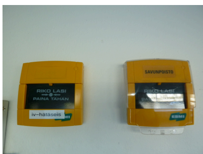
Manual smoke extraction activation