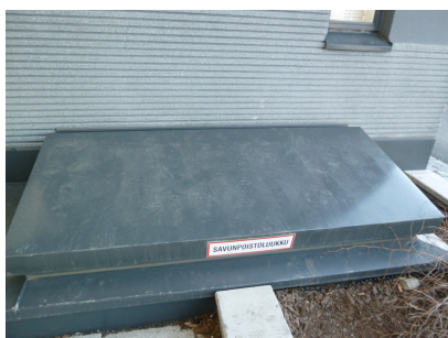
Smoke extraction hatch