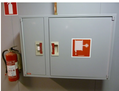
Initial extinguisher and fire hydrant