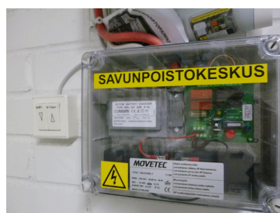
Smoke extraction panel