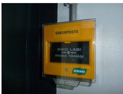
Manual smoke extraction activation