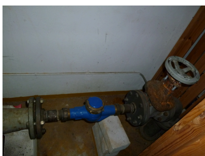
The main water stopcock