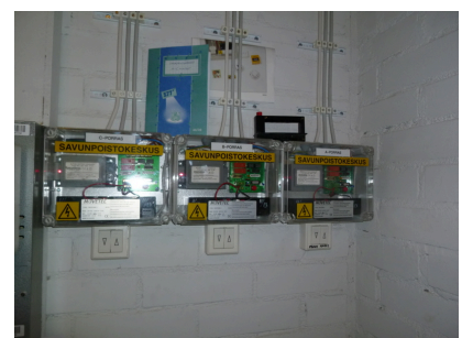
Smoke extraction panel