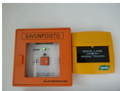
Manual smoke extraction activation