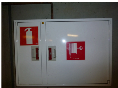
Initial extinguisher and fire hydrant

Hand-held fire extinguishers should be inspected: