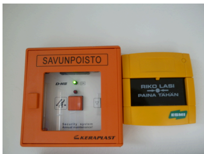
Air-conditioning emergency stop