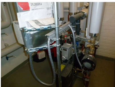
Heat distribution room.