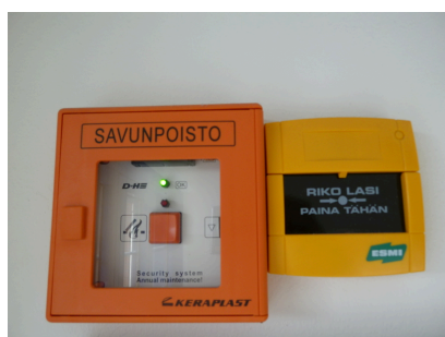
Air-conditioning emergency stop

Ventilation emergency stop: In conjunction with the entrance on the side of Mestarinkatu