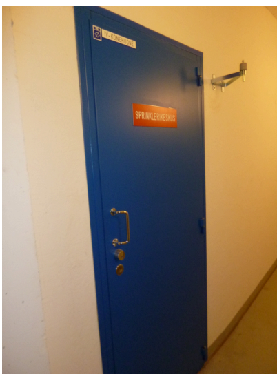
Sprinkler panel, door