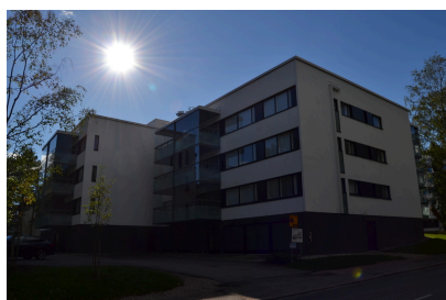
Elosalamantie 2 FG