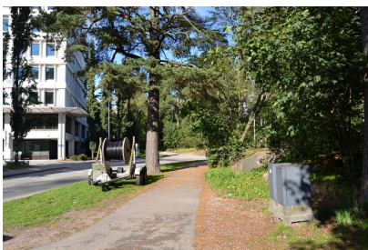
The assembly point of the hotel home

When people have left the building and proceeded to the gathering area, one person must be appointed to take responsibility for the activities at the gathering area. Based on the situation at hand, it is necessary to consider whether it is safe to remain in the designated gathering area or if people should be directed elsewhere, for example into a pre-arranged interior area or to a property in the vicinity (the back-up gathering area).