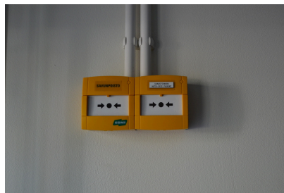
2 FG: IV-hätäseis ja savunpoiston laukaisu