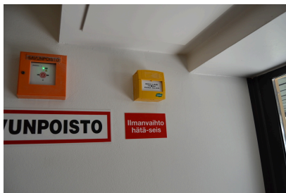
2 A-E air-conditioning emergency stop