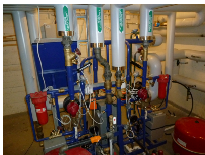
Heat distribution room.