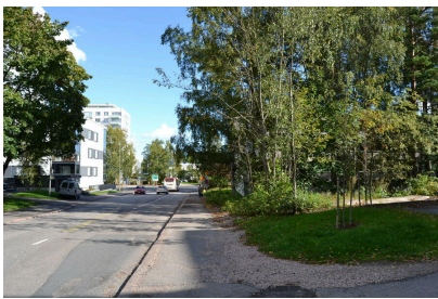
2 FG: Kokoontumispaikka