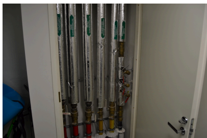
2 FG-talon kiinteistösulut