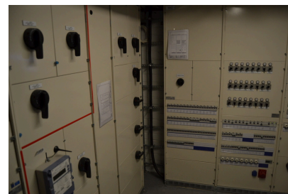
Main switchboard by staircase 2 E