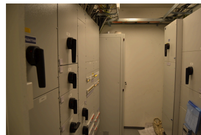
4 HI: Sähköpääkeskus