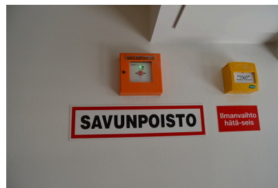
The smoke extraction activation of 2 A-E