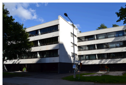
The hotel home 2 AB