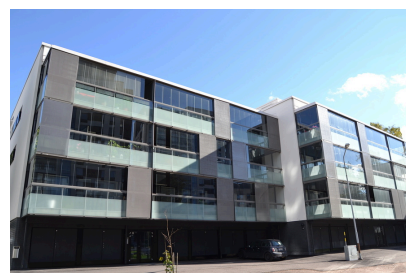
Elosalamantie 4 HI