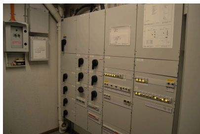
2 G: Sähköpääkeskus