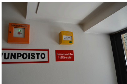
2 A-E air-conditioning emergency stop