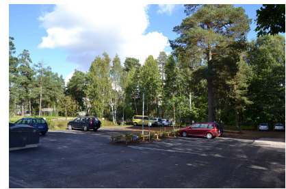
The assembly point in the inner courtyard