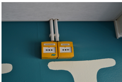
4 HI: Savunpoistonlaukaisu