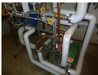
Heat distribution room.