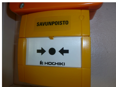
Manual smoke extraction activation